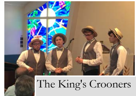
The King's Crooners