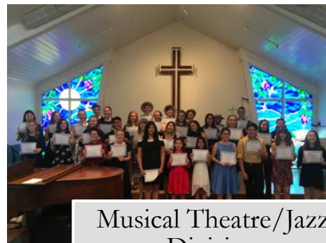
Musical Theatre/Jazz Division